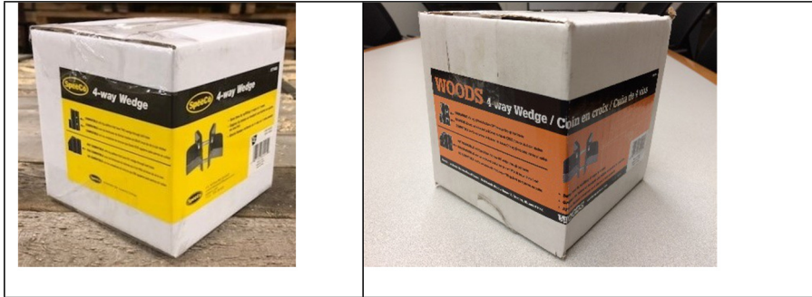
SpeeCo 4-way wedge packaging