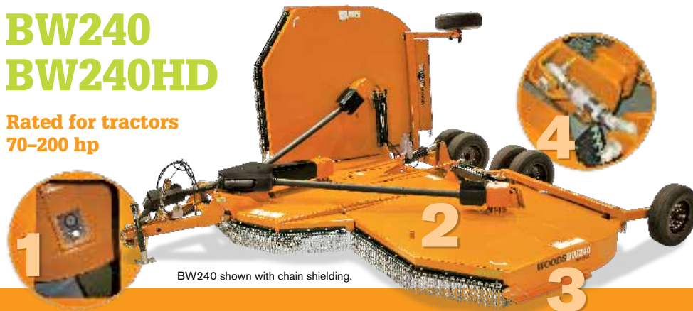
BW240 shown with chain shielding.