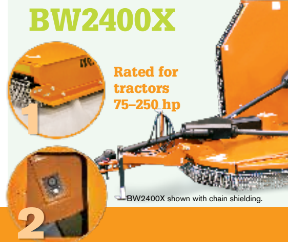
BW2400X shown with chain shielding.