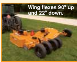
Wing flexes 90° up and 22° down.

PERFORMANCE GUIDE Ideal for maintaining road right-of-ways and cutting grassy fields, pastures, waterways and light brush up to 4" in diameter.